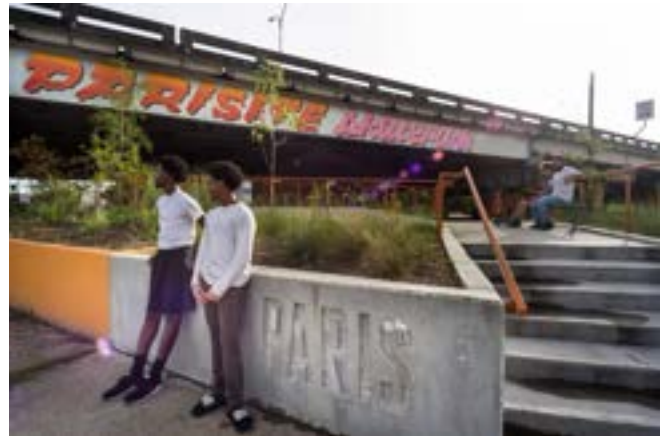
Figure 2. Parisisite Skatepark entrance, New Orleans, Louisiana.

Parisisite Skatepark is the only official skatepark in the City of New Orleans. Sited at the corner of Paris Avenue and Pleasure Street, the park is located in a historically underserved neighborhood and was initially created by a group of ambitious young skaters who took advantage of the vacant, under-utilized space. Word spread fast and the guerrilla skate park known as The Peach Orchard was established. The local skaters taught themselves how to design, build and maintain the skatepark until the city demolished the site citing public safety concerns. In 2010, the skaters started the Do-It-Yourself skatepark at the intersection of Interstate 610 and Paris Avenue (hence