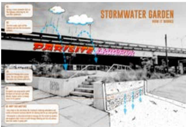
Figure 6. Educational signage installed on site.

Beyond the more dry and technical ways we worked to support and build power within our partner organization, careful thought and effort was put into who would speak at community meetings and events as the project spokespersons. We recognized there was a need to challenge stereotypical ideas about skaters and skate culture. Skaters presented the design work, precedents, and master planning, and spoke as experts in the park's creation. This served as an additional way to further legitimize and solidify the partner, and by extension the project.