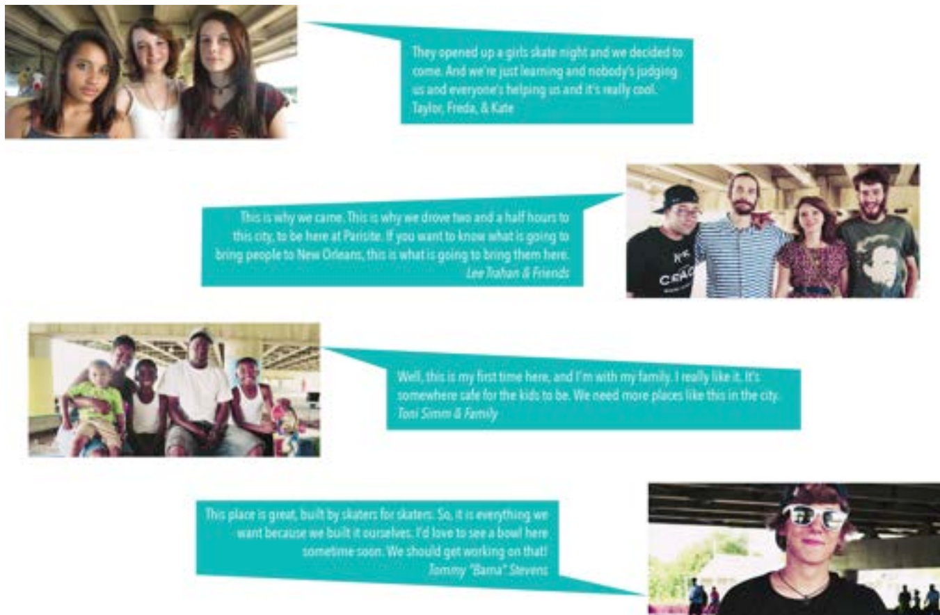
Figure 5. Testimonials.

concerns. Fliers on porches and conversations with neighbors were used to spread the word about meeting dates, times and agendas. With each subsequent meeting, a recap of what had been discussed and leading ideas to date were shared so the dialogue could continue to build. This process allowed trust to be established and maintained between all parties. In addition, the city's Capital Projects team often attended events and meetings, gave input on proposals, shared regulatory challenges, and offered potential solutions. They were provided regular project updates, ensuring they were an integral part of the team and committed to the execution of the project. The city's active engagement allowed them to see the capacity of the partner, the importance of user involvement in decision-making regarding recreation spaces, and offered an opportunity to highlight the importance of high quality design and the important role of architects in public projects.