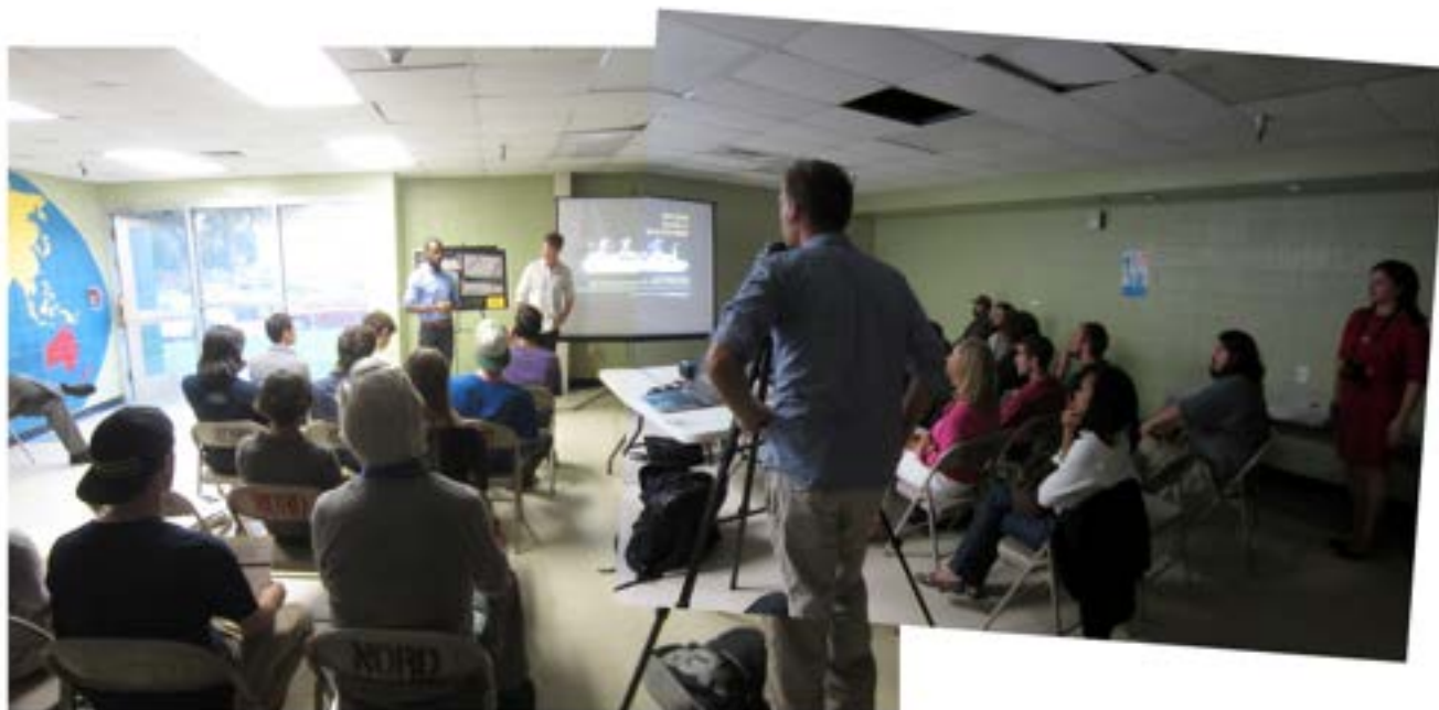
Figure 4. Neighborhood presentation and feedback session led by Transitional Spaces members.

and local approvals, the grassroots public park became New Orleans' first official skatepark.