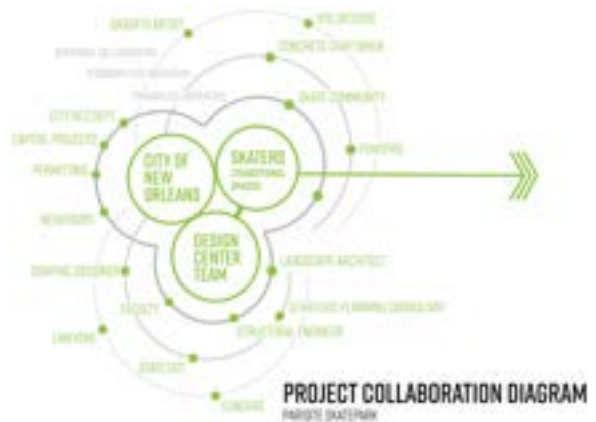
Figure 3. Diagram of skatepark project primary partners and the network of collaborators.

the name 'Paris Site'). With growing popularity, this informal public space once again drew the attention of city officials who questioned the legal implications of operating such a recreational space. The city made clear its plans to demolish the fledgling skatepark, which was under a federal interstate. The skaters approached the Small Center for technical and design assistance to protect the park and continue its build out.