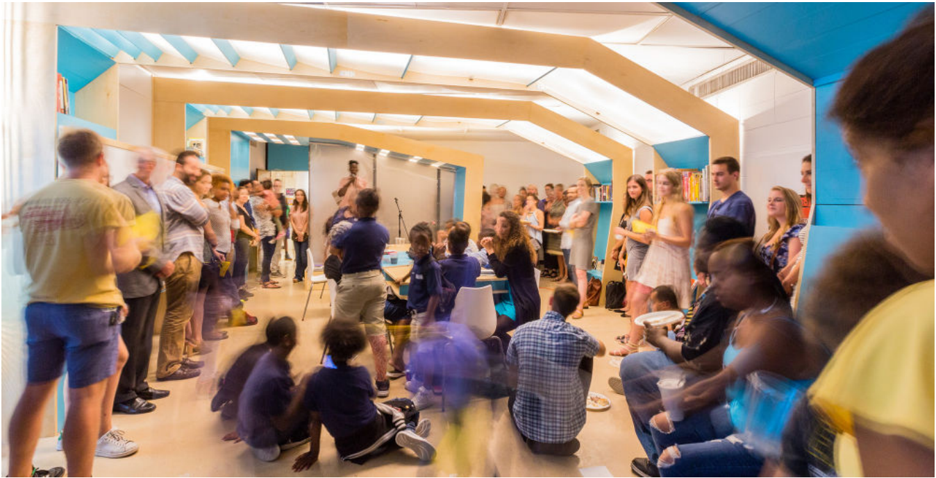
Figure 1: Big Class Writers' Room Event. Spring 2017 design/build collaboration with a non-profit youth writing program