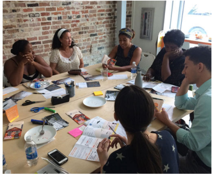
Figure 2: RFP Jury Process, Scorecard (left)

increasing equity), WANT for the project (does it provide and exciting design and education opportunity for our students?), and ABILITY to create a successful project (both in our ability to execute a project, and our partner's ability to maintain the built project or advance a visioning project). In addition to grounding our yearly project slate in actual needs of our partners and in our abilities, this RFP process is a first step in building trust with our stakeholders.